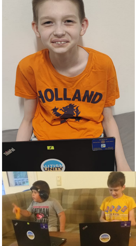
Ukrainian children use donated laptops for online therapy.