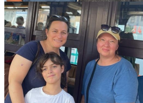
Hosts welcome Ukrainian Endocrinologist to study about delivery of transgender care.