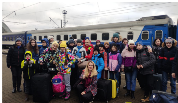
Pictured to the left are the families participating in the rehabilitation camp in Ukraine, an effort possible through donations from the Colors of Peace exhibit.