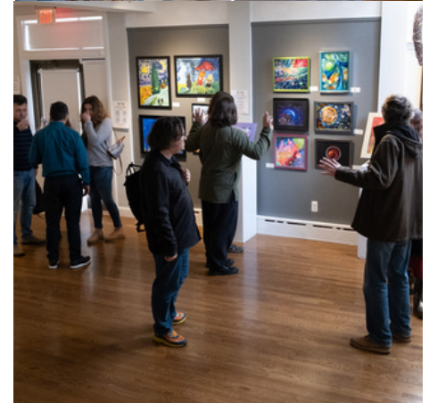
Colors of Peace charitable art exhibit and showcase from December.